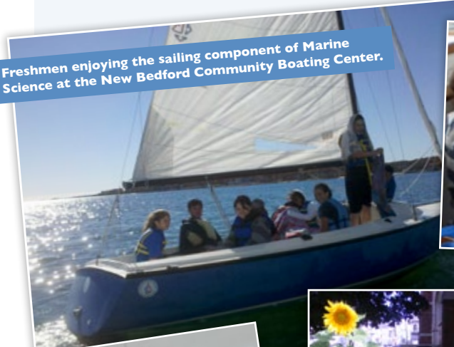
Freshmen enjoying the sailing component of Marine Science at the New Bedford Community Boating Center.