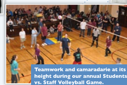
Teamwork and camaraderie at its height during our annual Students vs. Staff Volleyball Game.