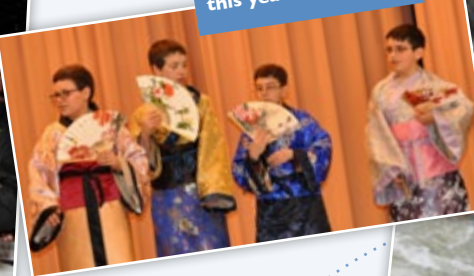
GLCPS Drama Club presented Mulan Jr. this year.