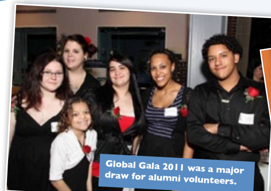
Global Gala 2011 was a major draw for alumni volunteers.