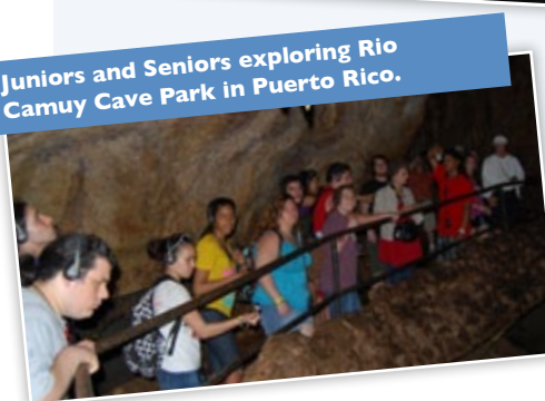
Juniors and Seniors exploring Rio Camuy Cave Park in Puerto Rico.