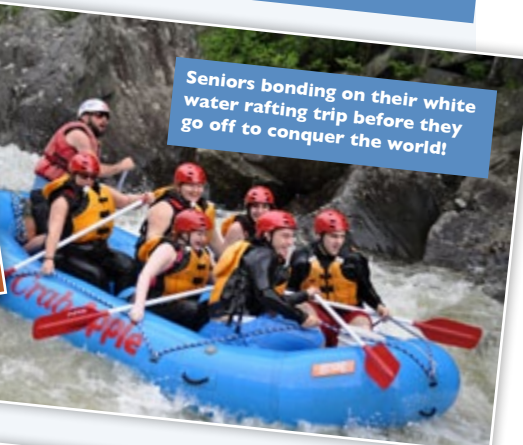
Seniors bonding on their white water rafting trip before they go off to conquer the world!