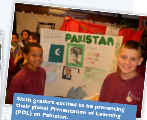
Sixth graders excited to be presenting their global Presentation of Learning (POL) on Pakistan.