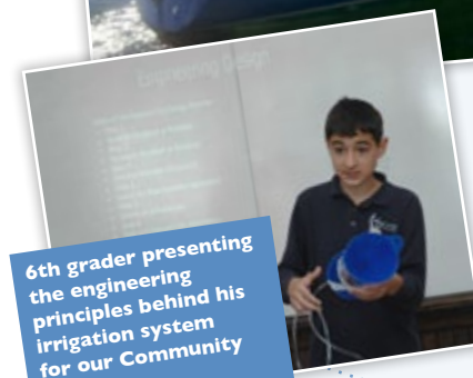
6th grader presenting the engineering principles behind his irrigation system for our Community Garden.