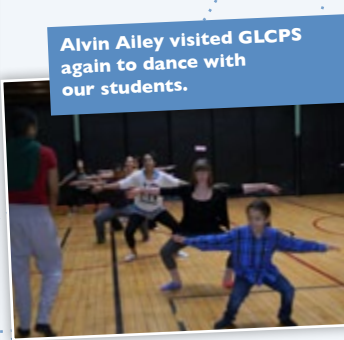
Alvin Ailey visited GLCPS again to dance with our students.