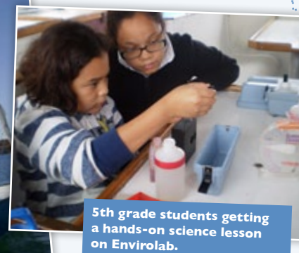
5th grade students getting a hands-on science lesson on Envirolab.